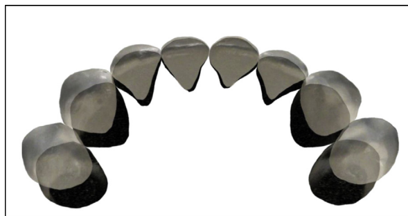
Fig 2. Representative example of the posttreatment non-extraction arch form ( light ) superimposed on the posttreatment extraction arch form.

The small posttreatment decreases in anterior arch perimeter and intercanine width were weakly related to postretention malalignment. Decreases in arch perimeter were slightly larger than previously reported; this is most likely due to posttreatment spacing. 8,9,26 This possibility is supported by the fact that the decreases in intercanine